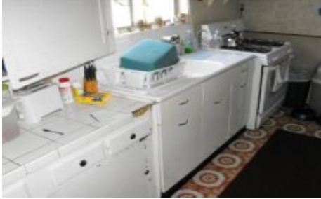
1378 W. Old Kitchen