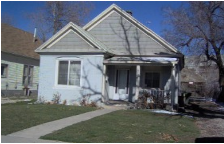
908 West Old Exterior