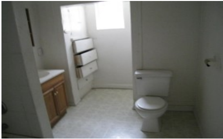
260 North Chicago Old Bathroom