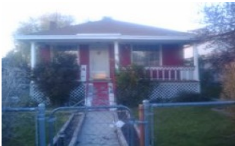
435 East Woodland Old Exterior