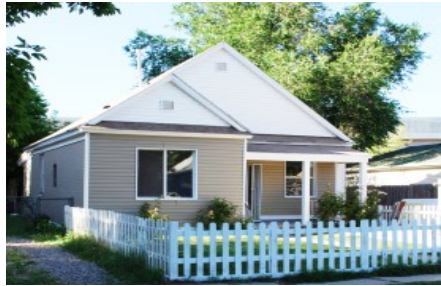
908 W New Exterior