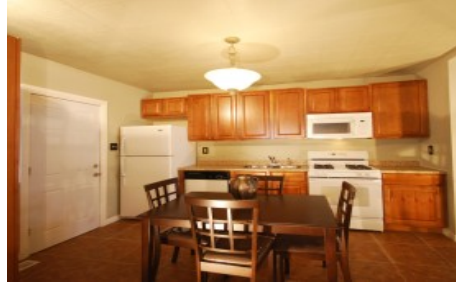
1378 W. New Kitchen