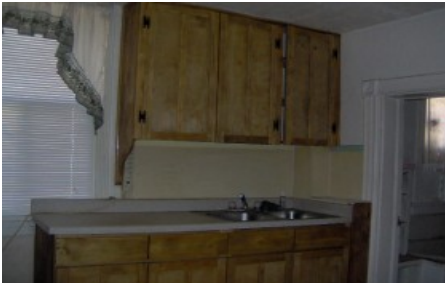
908 W Old Kitchen